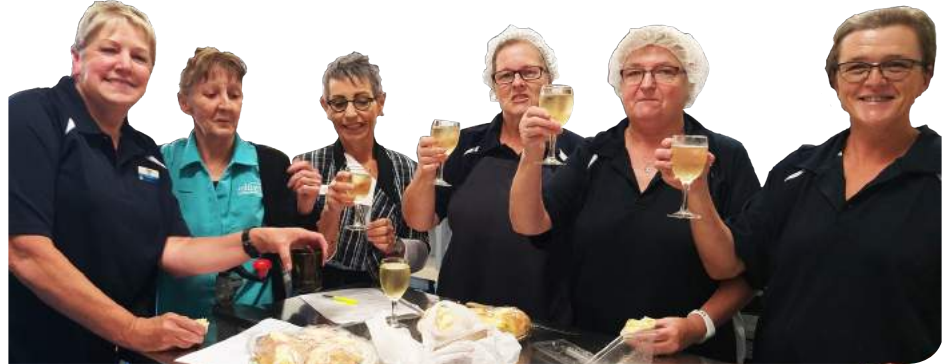
Some of the Oamaru kitchen team celebrate the first meals they sent to Oamaru Hospital