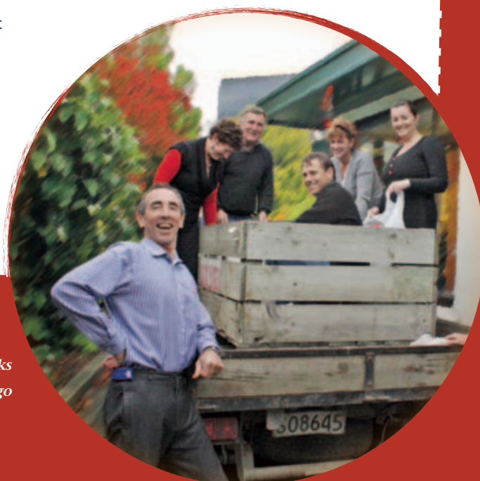
Working together: Support Centre staff unload apples donated to the Family Works foodbank by a Central Otago orchardist.

In fulfilling this vision, we will endeavour to act with Faith, Compassion, Respect, Integrity, Courage and Independence